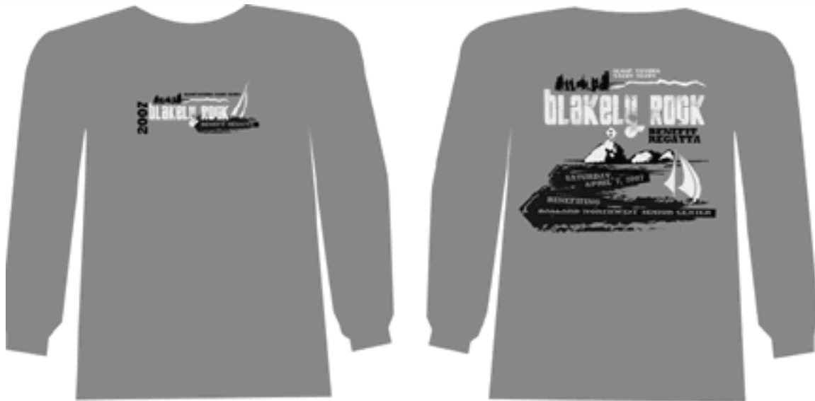
2007 Blakely Rock Benefit Regatta Tee Shirts - BRIGHT Orange

Sloop Tavern YC web site: http://www.slooptavern.org