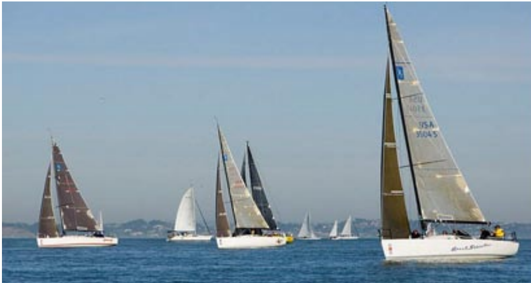
Great Sensation, Tabasco and Yeofy going to weather

Saturday: we did a 10:00 am show at the boat, rigged the boat and decided to get out a little early and practice. We sailed in light breeze and sunshine and worked up the bay and gybed back down to get into sequence for our start. There were 8 1D35's on the line and we got into position and got ready for the start. At this point we noticed no course no reader board etc (like the PNW) and thought to check the S.I.'s. Sure enough the colored flags were the course and we set our tactician to work and decided we would just follow the fast boats. We nailed our start in light air, got the boat moving and sailed wind pocket to wind pocket on the course, well as luck would have it we put our nose out front and noticed we were leading the fleet and it was time to get out the course again and figure it out. We had off and on breeze, a fun reaching course and settled in to race. We were slower than we should have been down wind on a couple of legs and the boat Yeofy saw a shot and took it and got by us. They raced a great race and we got second for the day.