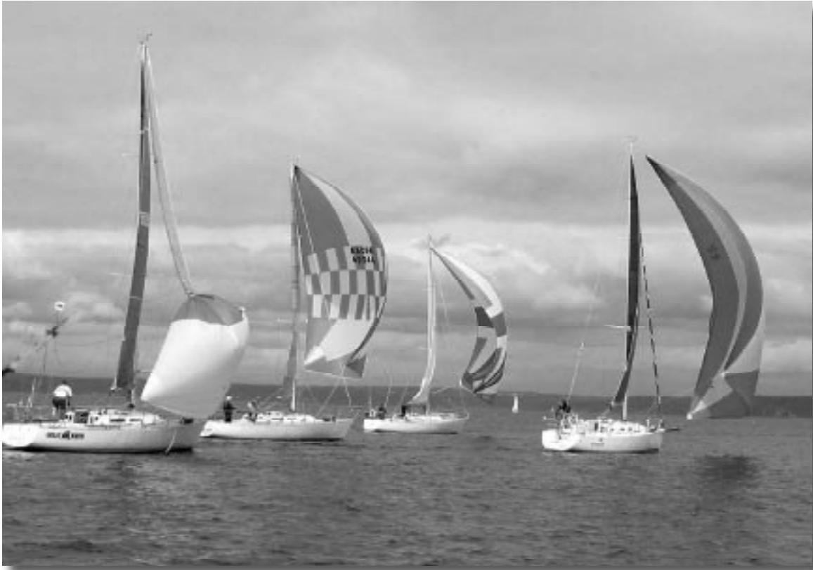
Race to the Straits 2005 - A start and first to Finish