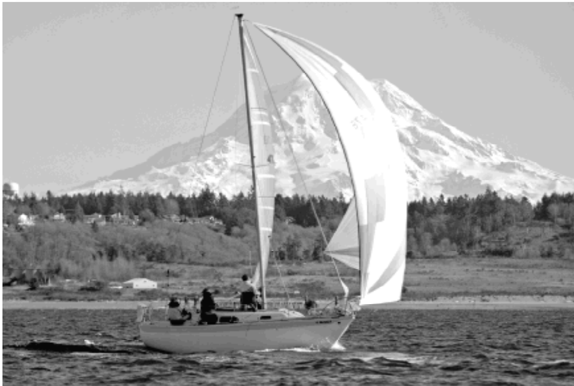
Green Card rips up the Southern Sound