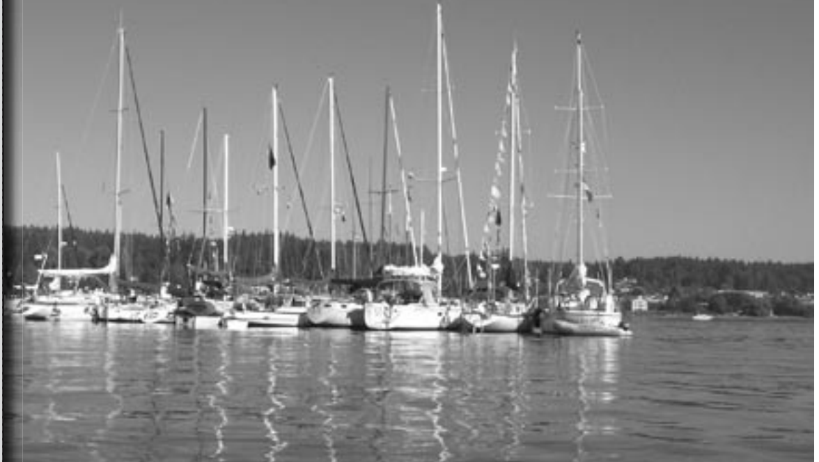
Liberty Bay Raft-Up 2005